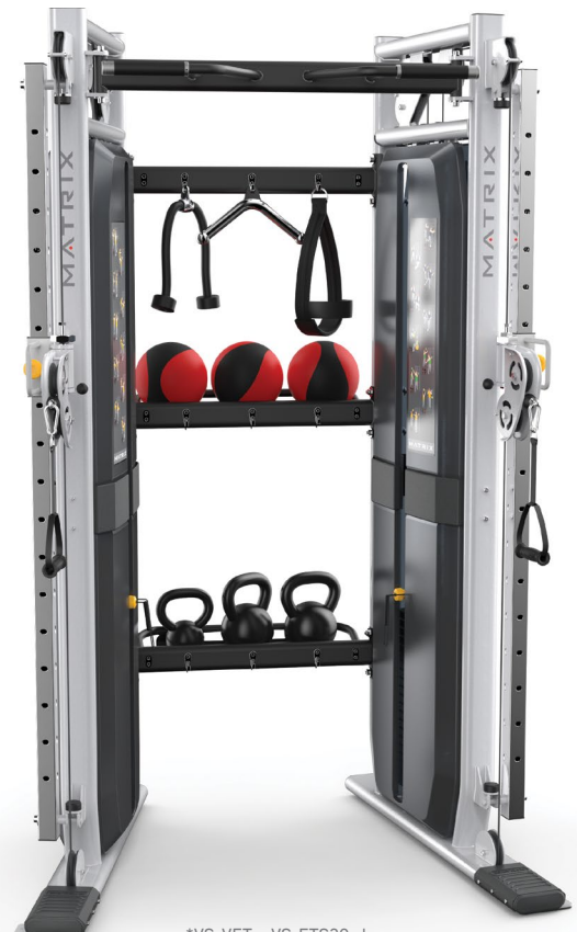
*VS-VFT + VS-FTS30 shown

Consists of 9 storage hooks as well as 2 shelves for storing various accessories