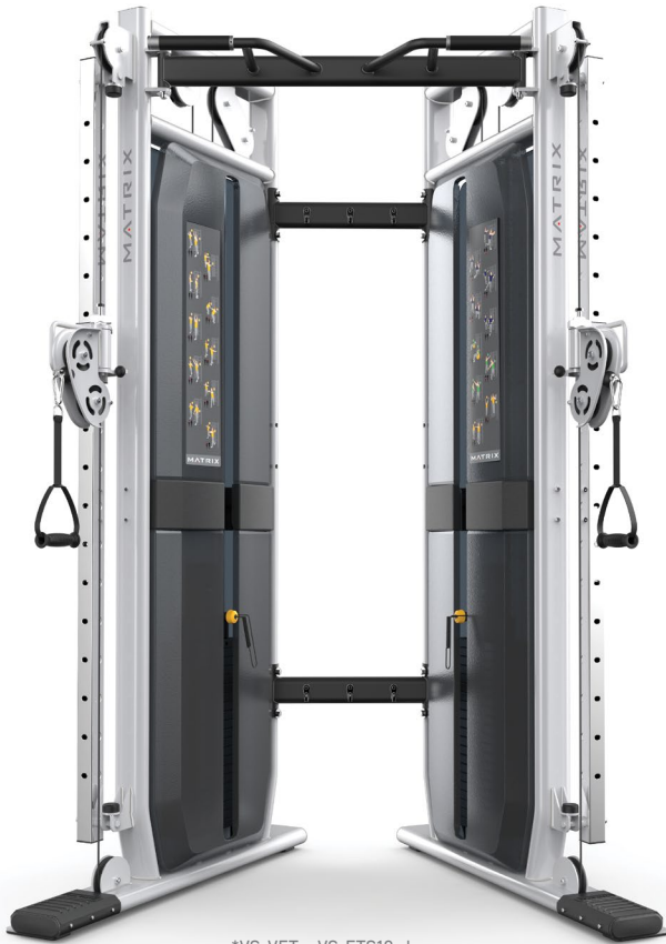
*VS-VFT + VS-FTS18 shown

Consists of 6 hooks for accessory storage